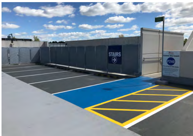
Completed with Safety Colours to selected areas