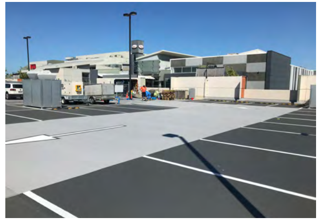
Completed section of Topcoats to selected Carpark colours