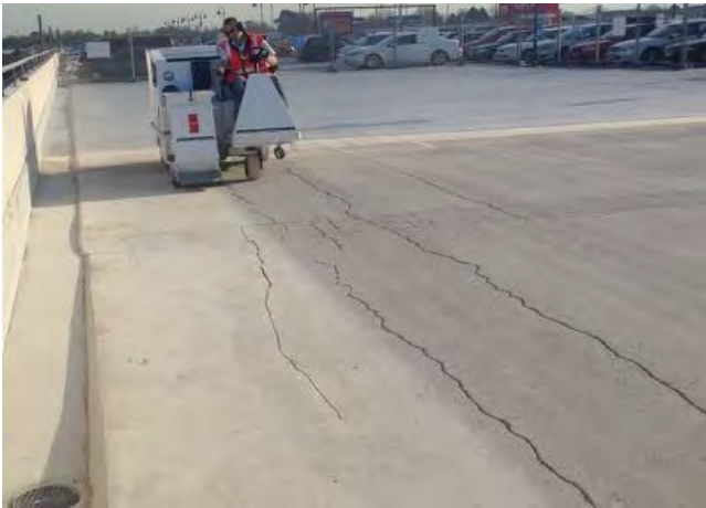
Preparation of substrate